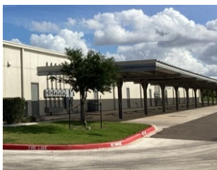
TCRMF member structure

There are different types of covered parking, but all can help protect your fleet and reduce the number of claims that are filed when a hail producing storm rolls through. Below are a few examples of covered parking: